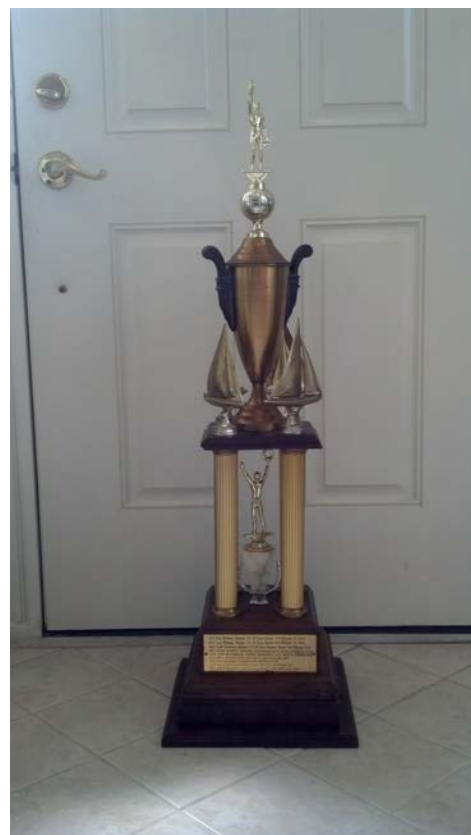
Comet Junior Championship Perpetual Trophy