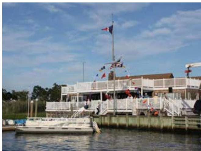
Shrewsbury Sailing & Yacht Club